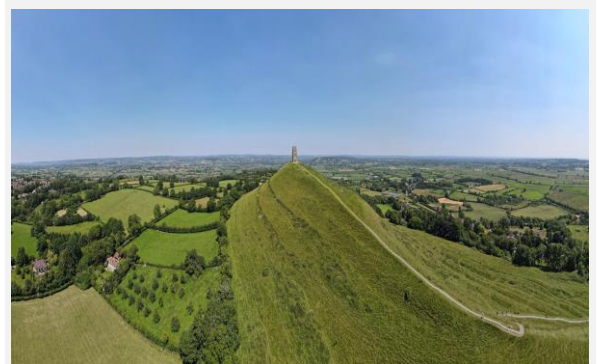
Photographs of Glastonbury Tor

Feeling a bit lonely or isolated? Telephone for a friendly chat 01823 345610